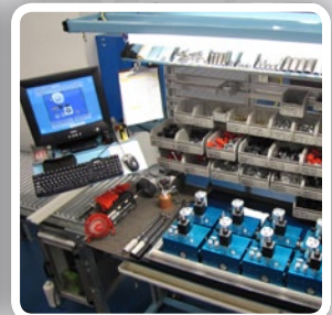
State-of-the-art production facility

For more info and to view more examples of our manifolds, visit: fluidpowersales.com or to talk to a representative, call one of our sales offices today. See back for sales office info.