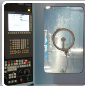
CNC manifold machining