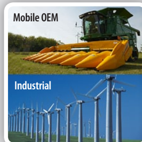
Wide range of applications